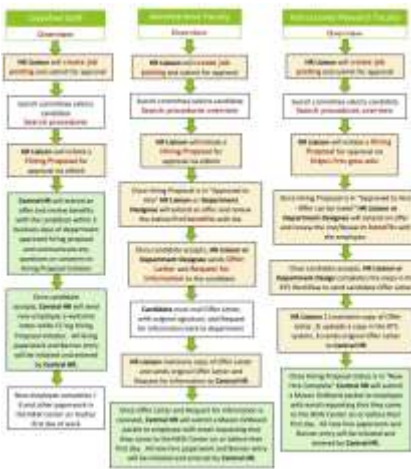
https://hr.gmu.edu/hrliaisons/docs/HRLiaisonReference.pdf Page 7